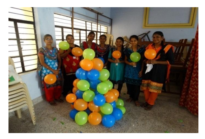
Time-management and Stress- Management