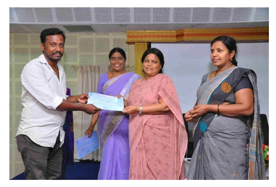
Participant receiving the certificate from the principal St. Mary's College, Thoothukudi