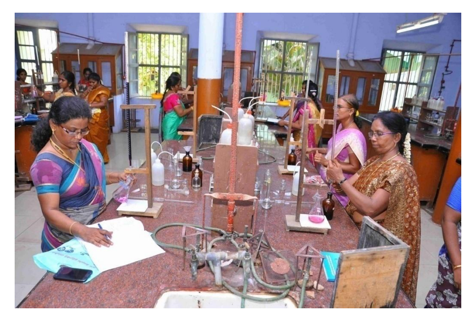
Participants doing experiments at Chemistry Lab of St. Mary's College, Thoothukudi