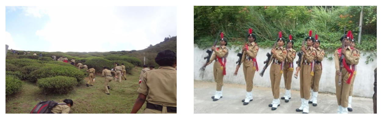
Centres for Excellence

Apart from their strenuous training programmes and camps, they have also done many social service activities and actively involved themselves in various awareness programmes like usage of e cards, blood donation, water conservation and protection of women against social evils. They have also performed the guard of honour and piloting to the chief guests of our college functions. Finally, on 31<sup>st</sup> January, 2018 they participated a one day training programme for their "B" and "C" certificate examinations. Thirty three II year NCC cadets appeared for their "B" certificate and twenty III year cadets appeared for their "C" certificate examination in the month of February, 2018.